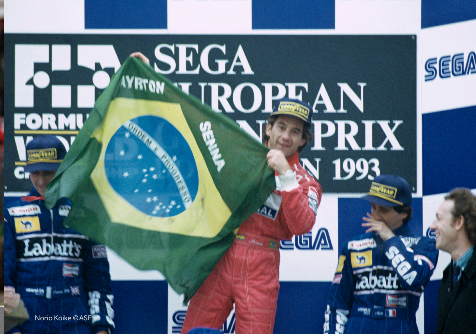
Norio Koike ©ASE