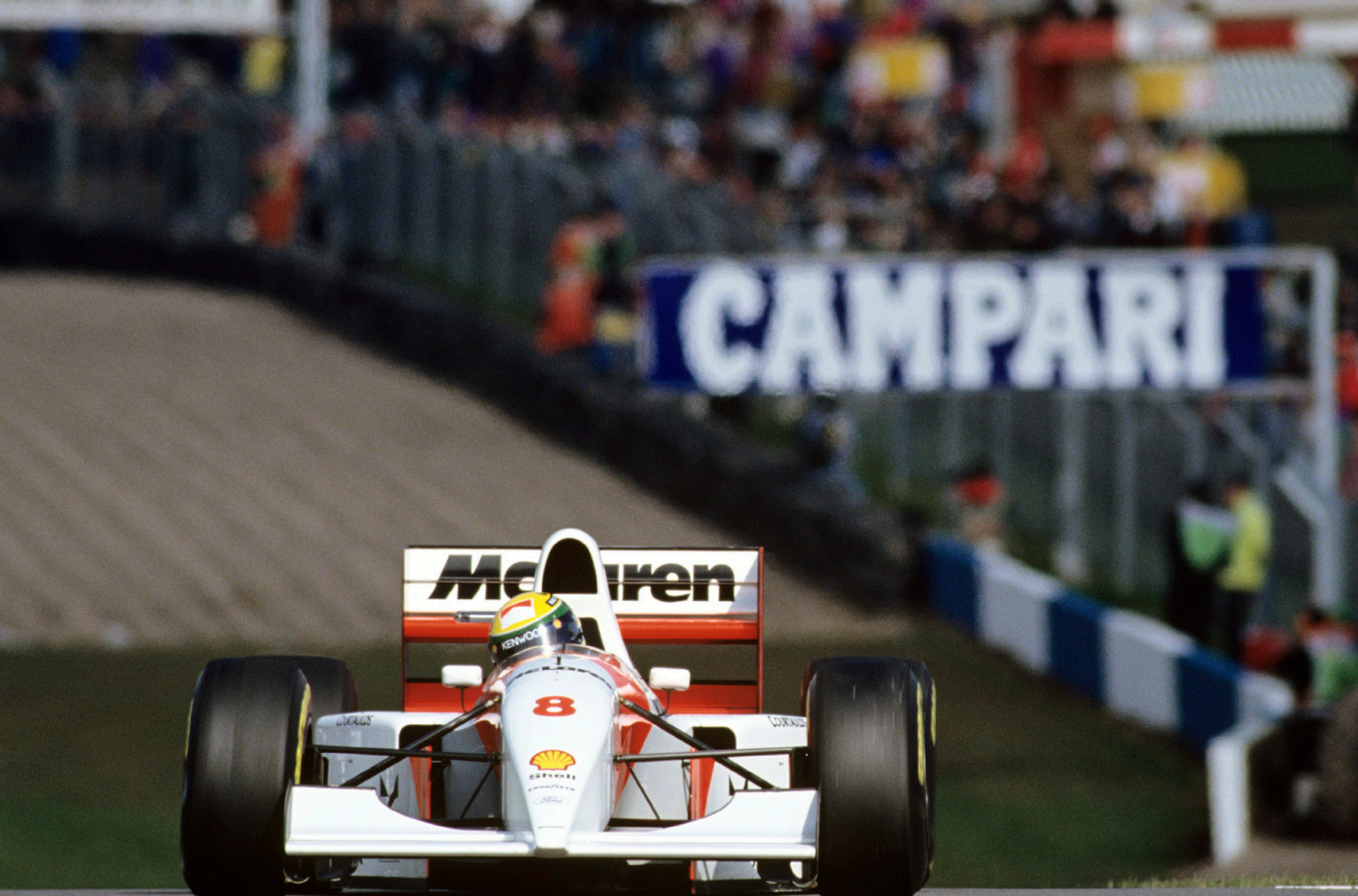
Norio Koike ©ASE